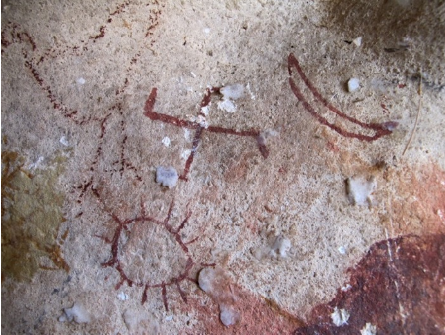
Fig. 1. A counterclockwise swastika flanked by the sun and moon, situated inside a small cave at Lce do, Gnam mtsho (Celestial Lake; Dpal mgon County/Gnam ru). This composition can be assigned to the Iron Age.

I have documented six examples of the sun-moon-swastika triad in rock art sites across the breadth of Upper Tibet. 6 By virtue of the sun and moon appearing with the swastika, it too appears to have a celestial identity. In four examples, the sun and crescent moon flank a counterclockwise swastika, as if the latter figure was of central importance. This arrangement seems to suggest that the swastika was envisaged as the nexus or fountainhead of the universe or of primary traditions (e.g., lineal, cultic, mythical), with the sun and moon as subsidiary symbols of signification. In this rock art, the swastika assumes a cosmogonic or proliferative dimension.