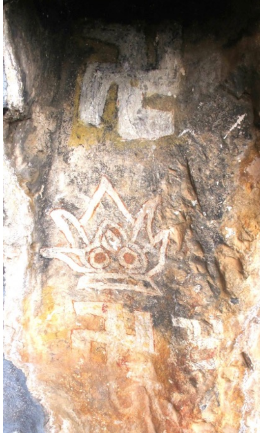
Fig. 6. Three counterclockwise swastikas (one above, two below) rendered in a white pigment (probably oxides of calcium) painted on a bluish (probably oxides of manganese) and yellow ochre (oxides of iron) background. In between the swastikas are 'flaming jewels' ( nor bu me 'bar ) in white and red ochre. Below the lower swastikas is the Tibetan letter A. Rta mchog ngang pa do, Gnam mtsho (Dpal mgon County/Gnam ru). Vestigial period.

how early beliefs permeating the rock art in fig. 5 may have specifically impacted Yungdrung Bon doctrine and mythology. The semantics of ancient images belonging to archaic religious traditions were not per force translatable into the written word.