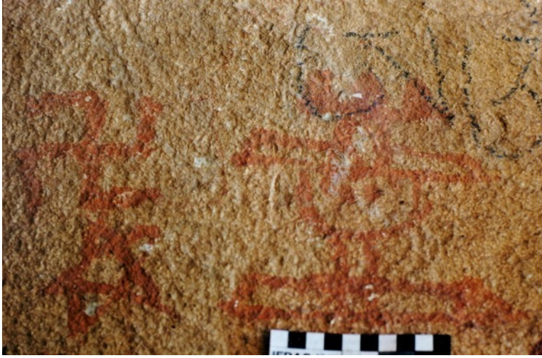
Fig. 7. What appears to be the portrayal of a ritual structure, featuring a wide pedestal, short stem, semicircular midsection, broad entablature, and tricuspidate finial. To the left of this subject there is a five-pointed star and counterclockwise ( g.yon skor ) swastika that are part of the same composition, as seen in the uniform style of painting, pigment color and wear characteristics. Bkra shis do chung ('Dam gzhung County/Gnam mtsho). A comparable subject at the same site appended to a mantric inscription indicates that this rock art belongs to the Early Historic period.

This particular style of what appears to be a ritual construction has not survived in Yungdrung Bon art of today. Rather, it is an obsolete representation, the precise functions of which are obscure. The star is a symbol of meteoric metal in Yungdrung Bon iconography, but it is not known if the pictographic star was assigned that meaning. In the period in which this rock art was made, the orientation of swastikas took on sectarian overtones. The counterclockwise version came to be associated with bon and the clockwise variety with Buddhism, a sectarian distinction largely maintained to the present day.