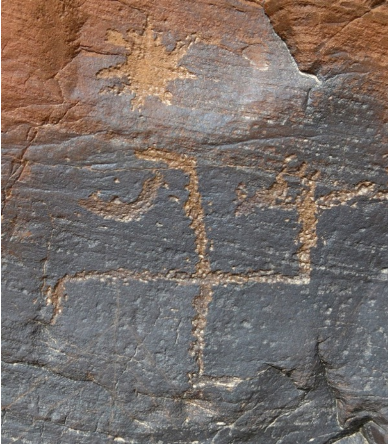
Fig. 2. A sun, moon and swastika carving on a boulder in Spiti, a lower elevation region of the Tibetan Plateau situated immediately west of Upper Tibet. Iron Age or Protohistoric period. The three figures appear to constitute an integral composition, as they were produced using the same carving technique and exhibit similar wear characteristics. The lighter hue of the sun can be attributed to the stripping away of the patina once covering the boulder due to localized geochemical processes.

links between Yungdrung Bon and pictographs and petroglyphs cannot be postulated with assurance, the seminal role of the swastika in prehistory is likely to have informed later religious discourse, as ancient traditions were adjusted or transformed to meet the needs of Tibetans in the historic era.