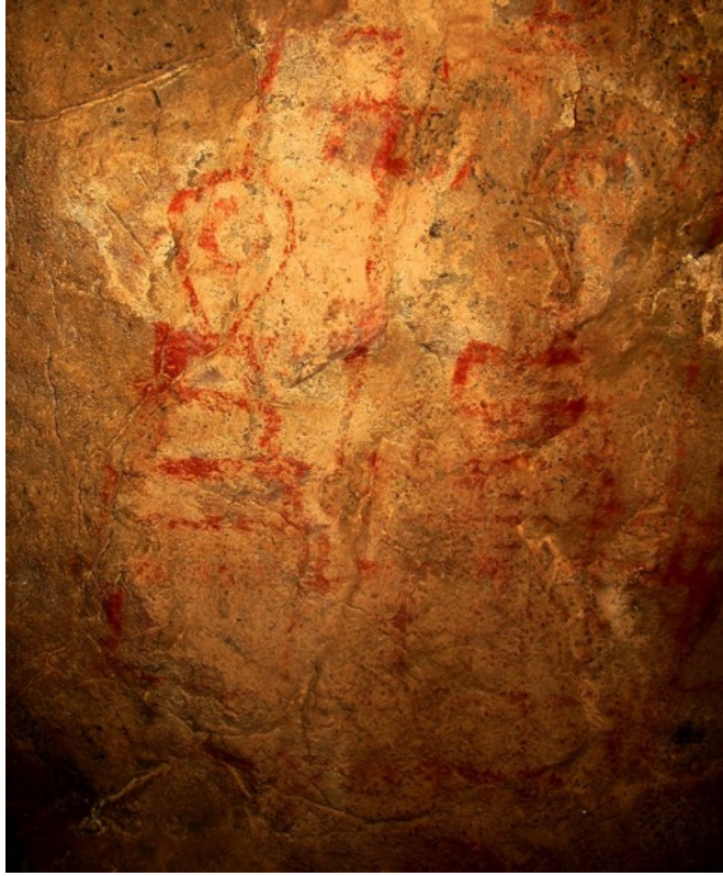
Fig. 8. A pair of red ochre stepped shrines with tall, interconnected base, graduated tiers, tear-drop-shaped midsection and simple mast. A counterclockwise swastika rises above the two shrines. This composition was painted inside the ancient cave sanctuary of Sgar gsol brag phug (Shen rtsa County/Nag tshang). Early Historic period.

This is another example of a stepped shrine form that was not retained in the Yungdrung Bon artistic canon. As with fig. 7 (and many other rock art specimens in Upper Tibet), this demonstrates that religious architecture advanced over time in Tibet, assuming modern proportions only after ca. 1000 CE. That standard forms of Yungdrung Bon mchod rten do not occur in the ancient rock art of Upper Tibet drives home the fact that they have a relatively late genesis as part of the prevailing religious milieu. Along with considerable differences in design, it might be expected that functions accorded stepped shrines also underwent modification after the Early Historic period. 13