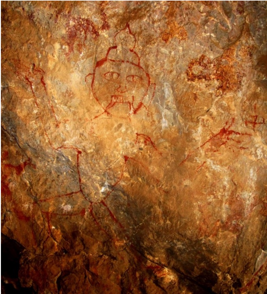
Fig. 16. Another large priestly or divine figure painted inside Sgar gsol brag phug (Shan rtsa County/Nag tshang). Early Historic Period. This individual is depicted with a tall, pointed crown or topknot, a pair of prominent fangs, odd-shaped ears, cat-like pupils, and flexed arms and legs. He does not appear to wear any clothing. Note the counterclockwise swastika above the left hand of the figure, which seems to be an integral part of the composition.

mtsho, Stong rgyung mthu chen, according to Yungdrung Bon texts. Like stepped shrine rock art, this pictograph anticipates Yungdrung Bon iconographic conventions that emerged ca. 1000 CE. This is not surprising in that there are numerous ideological and procedural affinities between Old Tibetan and Yungdrung Bon mytho-ritual literature, despite the differing religious orientations.