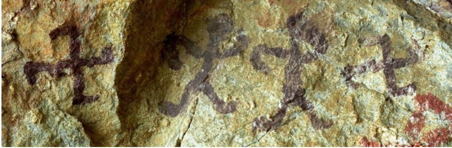
Fig. 12. A pair of anthropomorphic figures whose pose mimics one another, as if simulating a dance or some other kind of orchestrated activity. The pair is flanked by two counterclockwise swastikas, once more hinting at the long-term importance of this symbol on the Western Tibetan Plateau. The red ochre used to make the pictographs is unusually dark in color. Srin mo kha gdang, Spiti. Protohistoric period.

materials involved. Indeed, many anthropomorphs are so cursorily rendered that few anatomical or cultural traits are discernable.