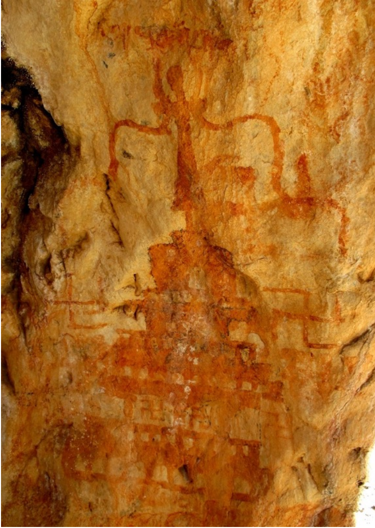
Fig. 11. An intricately painted mchod rten with three counterclockwise swastikas flanking it and two swastikas in the third tier of the base. 14 Bkra shis do chung ('Dam gzhung County/Gnam mtsho). Early Historic period. Some of the nine or ten layers of the lower portion of the pictograph are segmented into small squares. The small midsection tapers inwards and is topped by an arrow-shaped spire. The crown consists of forked lines with a rounded prong in the center, resembling the horns of the bird, sword of the bird ( bya ru bya gri ) finial of Yungdrung Bon. Two curling banners extend from the half-circular rain cover ( char khebs ) below the finial.

Like fig. 10, this specimen is comparable to Yungdrung Bon mchod rten , but it is decidedly more old-fashioned in appearance. Forked finials