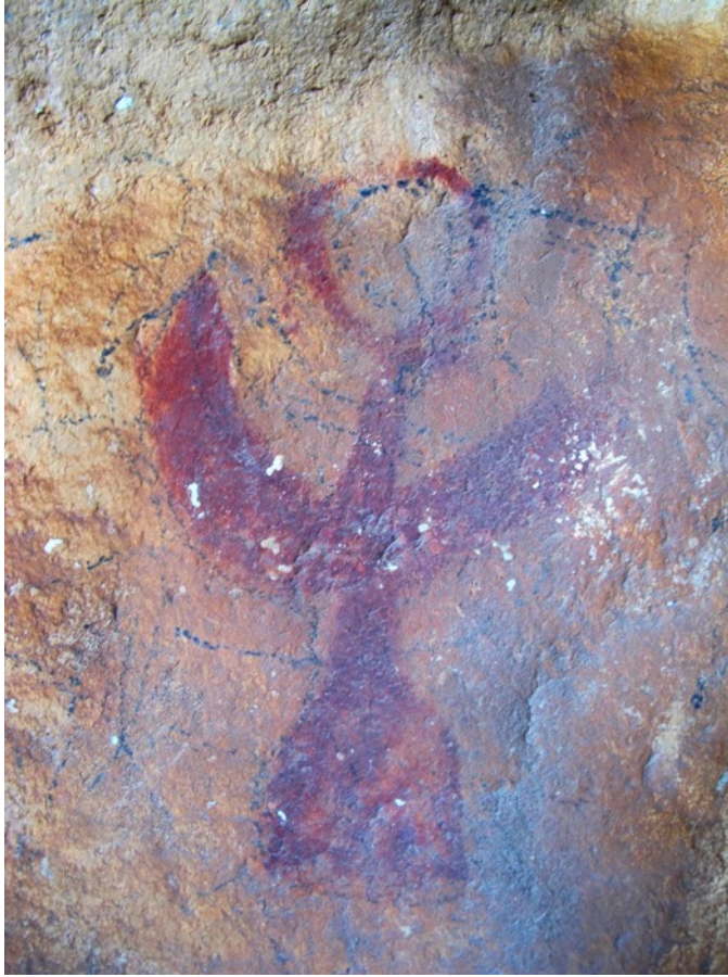
Fig. 17. A red ochre khyung with prominent horns almost forming a circle, a head that appears to point to the right, long, narrow body, upraised wings, and bell-shaped tail. Ra ma do, north shore of Gnam mtsho (Dpal mgon County). Protohistoric period.

This highly worn pictograph is one of at least 16 horned eagles I have documented in the rock art of Upper Tibet. Nearly all examples show the khyung with spread wings soaring in magnificent isolation, as part of a well developed tradition of zoomorphic portraiture in the region. These carvings and paintings are situated across Upper Tibet and vary in age from the Late Bronze Age or Iron Age to the historic era. Given its wide spatial and temporal distribution, the horned eagle is truly an iconic subject. 25 It is in the Early Historic period that the khyung of rock