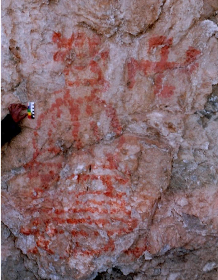
Fig. 9. A more complex stepped shrine painted in red ochre, O rgyan phug, Bkra shis do chung ('Dam gzhung County/Gnam mtsho). Early Historic period. As with other examples illustrated in this article, the red ochre counterclockwise swastika is an integral part of the composition.

The five-tired base ( bang rim ) and rounded midsection ( bum pa ) resemble more modern variants of the mchod rten , however, the spire ( 'khor lo ) and finial ( tog ) are unconventional in form. The squat spire topped by two thick prongs belongs to an extinct style of architectural depiction.