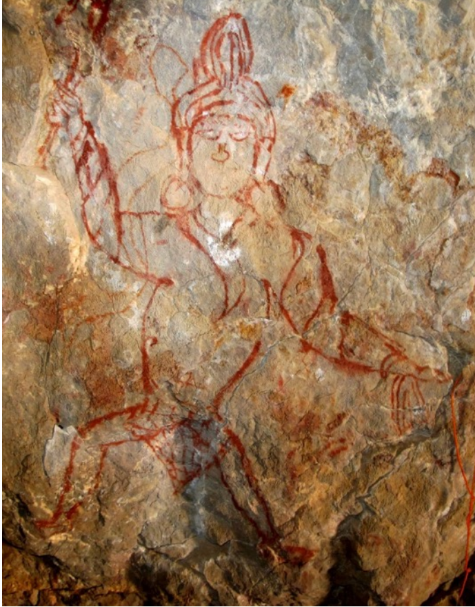
Fig. 15. An adept or priest painted in red ochre more than half life size (1.1 m in height). Sgar gsol brag phug (Shan rtsa County/Nag tshang). Early Historic Period. The standing male figure is attired in a tight-fitting shirt and what appears to be a tiger skin loincloth ( stag sham ). The upper garment has a low collar, tight fitting sleeves and opens along the middle of the chest. A turban is wound around the head and prominent topknot ( thor gtsug ) of the figure. Large hoop earrings hang from drooping ears and the eyes and mouth are semi-circular. The figure wields a hook ( lcakyyu ) in the right hand and appears to be holding a coiled lasso ( zhags pa ) in the left. He wears low-slung footwear or what might be anklets.

of choice in Tibetan ritualism. The quadripartite arrangement of the circular motif is reminiscent of shamanic drums used throughout Inner Asia. Each figure has a tail-like extension in the rear, presumably a type of dress or zoomorphic flourish.