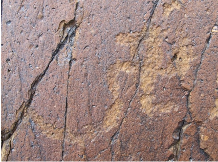
Fig. 3. The swastika joined to a crescent carved on a vertical rock face, Bshag bsangs (Nyi ma County/Nag tshang). Iron Age or Protohistoric period.

cognate genres of rock art (eg., animal style carnivores, wild yak hunting, horned eagles, stepped shrines, etc.), this signals that Spiti enjoyed close and sustained cultural ties with its much larger eastern neighbor. 7