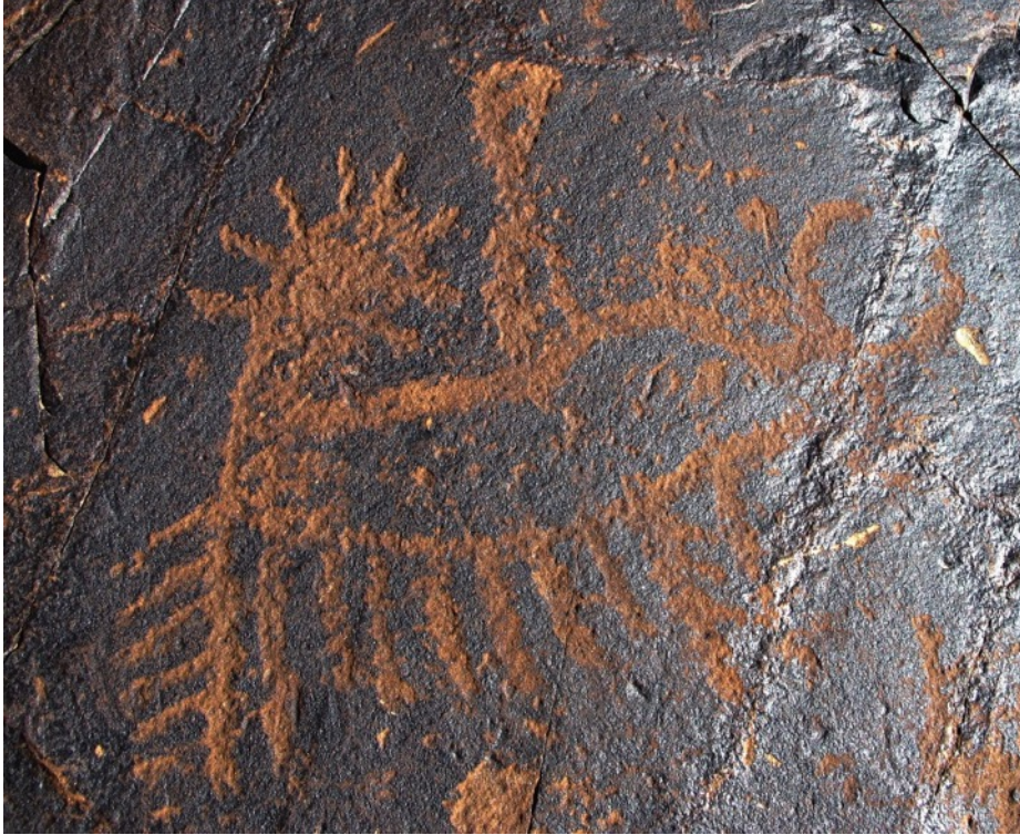
Fig. 19. An anthropomorphic figure mounted on a wild yak. Skyil grum (Dge rgyas County/Tshwa kha). Iron Age.

priestly personalities riding wild bovids in Tibet. Again, it must be stressed that relating this rock art to the literary record in anything but general terms is a provisional exercise.