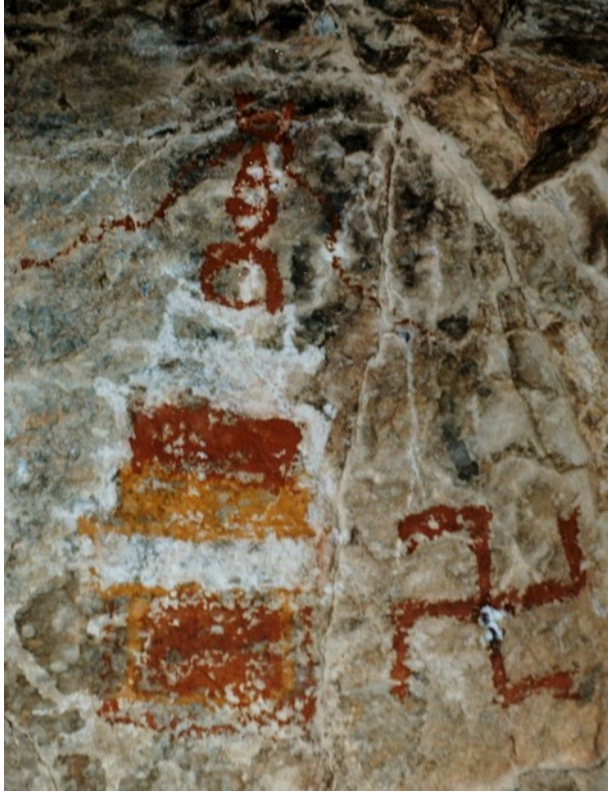
Fig. 10. With its multi-tiered base, rounded midsection, cigar-shaped spire, forked finial, and long, flowing banners ( dar thag ), this polychrome stepped shrine resembles more closely those of the Yungdrung Bon tradition. Brag khung mdzes po (Nyi ma County/Nag tshang). Early Historic period.

Numerous design parallels with Yungdrung Bon variants notwithstanding, this stepped shrine is an unorthodox or precursory facsimile. The spire is too short, the midsection excessively small, and the base not stepped enough to belong to the religion of today. Yet, these features are repeated in other Upper Tibetan stepped shrine rock art of the same period. They are indicative of widely circulating styles of depiction in the Early Historic period. The prototypical appearance of these stepped shrine strongly suggests that they are predecessors of Yungdrung Bon mchod rten of the post-1000 CE era. These antecedent depictions reveal that the architectural and iconometric standardization of the mchod rten , as seen in Yungdrung Bon and Tibetan Buddhism, postdates the Early Historic period.