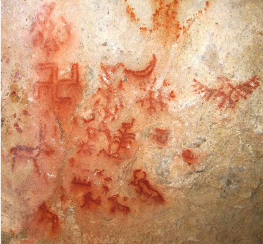
Fig. 5. The counterclockwise swastika and crescent moon amid a host of other figures, Lha ris sgrub phug, (Shan rtsa County /G.yag pa). Protohistoric period. These two symbols are included in an assortment of key figures, among which is a sun, crescent moon, two trees, raptor with outstretched wings, what may be an anthropomorphic couple, wild yak and several other wild herbivores, archer, and a row of four triangular subjects (ritual structures?). The uppermost animal in the photograph is a raptor created in a style (diamond-shaped wings and triangular body and tail) also seen in far western Tibet, Spiti and Ladakh. The Tibetan letter A at the top of the image was made in a later period.

Most of these sundry figures appear to have been painted by the same artist. 9 The array of protean symbols (sun, moon, swastika, tree), vital economic structures (wild ungulates, hunter), cultic emblems (raptor, triangular subjects), and social constructs (couple) conveys a panorama of the life and culture of its maker, furnishing us with an extraordinary view of ancient Upper Tibet. In general terms this recalls the Yungdrung Bon leitmotif, 'the swastika of life'. Again, it is unclear