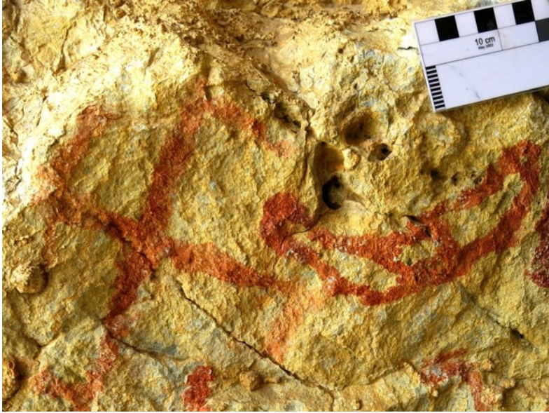
Fig. 4. The swastika and crescent moon painted in red ochre among many other pictographs in the high elevation cave sanctuary known as Srin mo kha gdang (Gaping Mouth of the Ogress), Spiti. Protohistoric period.

engendering qualities of the swastika in Yungdrung Bon may have been inspired by its earlier solar connotations.