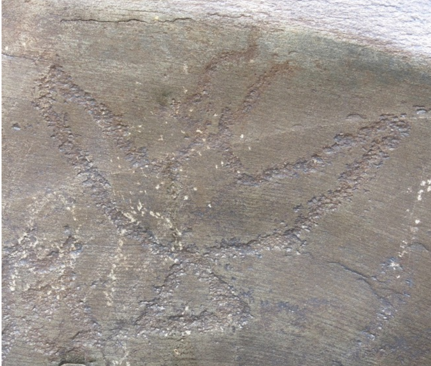
Fig. 18. Khyung with double-curved horns, triangular beak facing left, outstretched wings, bi-triangular body, and fan-shaped tail. Sum mdo 2 (Spiti). Probably Iron Age.

art and texts converge chronologically, illustrating its pervasiveness in the Tibetan world of that time. Furthermore, rock art corroborates the prehistoric status of the horned eagle as presented in Tibetan literature. Although pictographs and petroglyphs of horned eagles cannot be related infallibly to specific accounts in Old Tibetan and Yungdrung Bon literature, the themes conveyed in them are likely to resonate with rock art depictions, serving as a broad-based tool of identification and analysis.