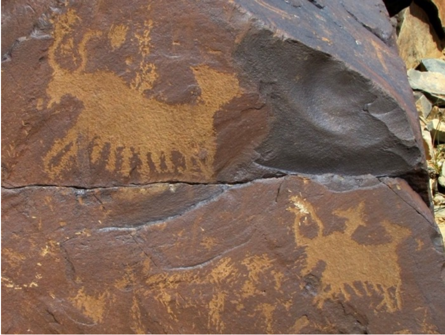
Fig. 20. Two wild yaks with what appear to be highly stylized riders. In this rendering the wild yaks have wedge-shaped tails and double-curved horns. Skyil grum (Dge rgyas County / Tshwa kha). Iron Age.

Whether depicting divine, heroic or priestly riders, or something entirely different, it appears that wild yaks were already seen as magical carriers in the prehistoric era, as they still are in contemporary Tibetan religious belief.