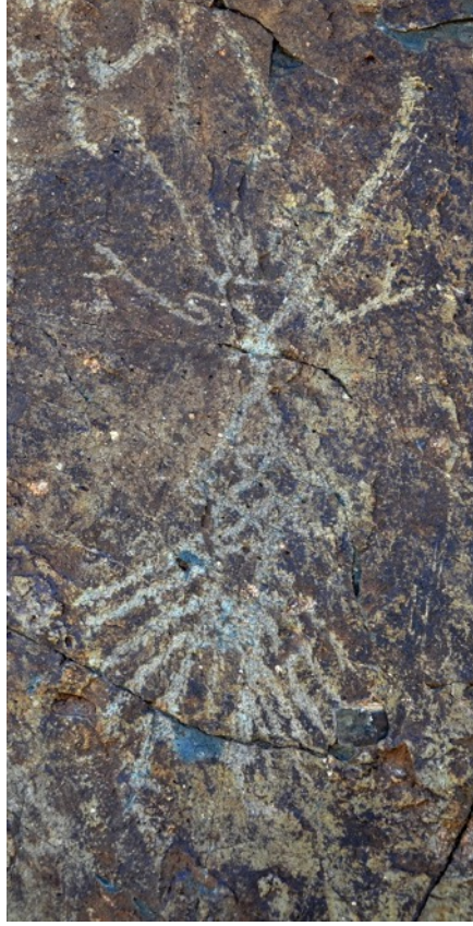
Fig. 13. A lone figure with avian and anthropomorphic qualities. Mtha' kham pa ri (Ru thog County/Ru thog rdzong). Protohistoric period.

This figure stands on two legs from which lines spread out like the fringe of a skirt. In the middle of its diamond-shaped torso is a diamond motif set between two triangles. On the right side of the body is an oblong form. The head is triangular with two sinuous lines curling outward at ear level. Two long, hornlike lines surmount the top of the head. These carved motifs lend themselves to comparison with traits of ancient priests enumerated in Yungdrung Bon and Old Tibetan literature. For instance, one might compare the bird-like skirt to a vulture feather overcoat ( bya rgod kyi thul pa ), the oblong form to a drum ( rnga ), the ear-level lines to ribbons ( go pan ), and the headdress to the bird horn crown ( bya ru ). 20 While none of these identifications is certain, Ti-