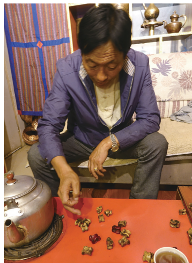
Fig. 5 A Tibetan man teaching the rudiments of a popular knucklebone game to the author in Skye rgu mdo.