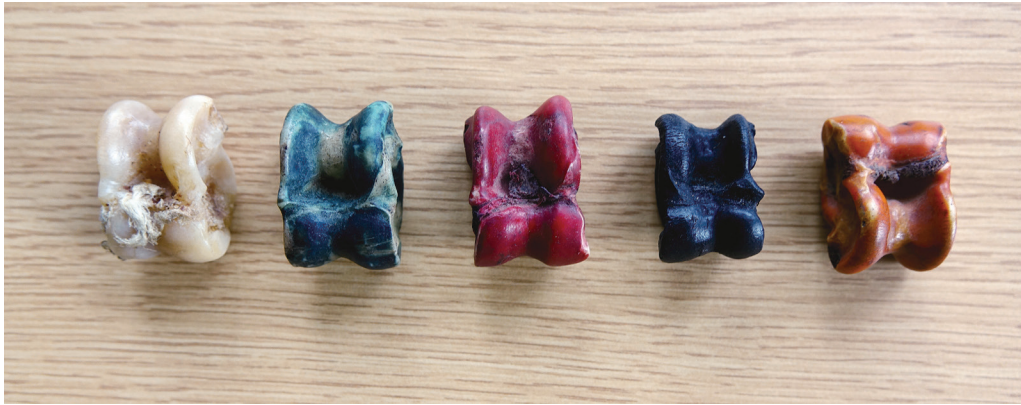
Fig. 6 Five different colored antique Tibetan ovicaprid astragali, such as those used for divination. Collected by a Khams pa and used in Khams.

Another function for the ovicaprid astragalus was as a calculating tool for keeping accounts. In the system explained to me an astragalus is equivalent to one hundred units of something in weight or number. Small tally sticks called bcu shing were used to represent ten units of something. These accounting devices were stored in a sack and consulted over the long-term to determine one's financial position.