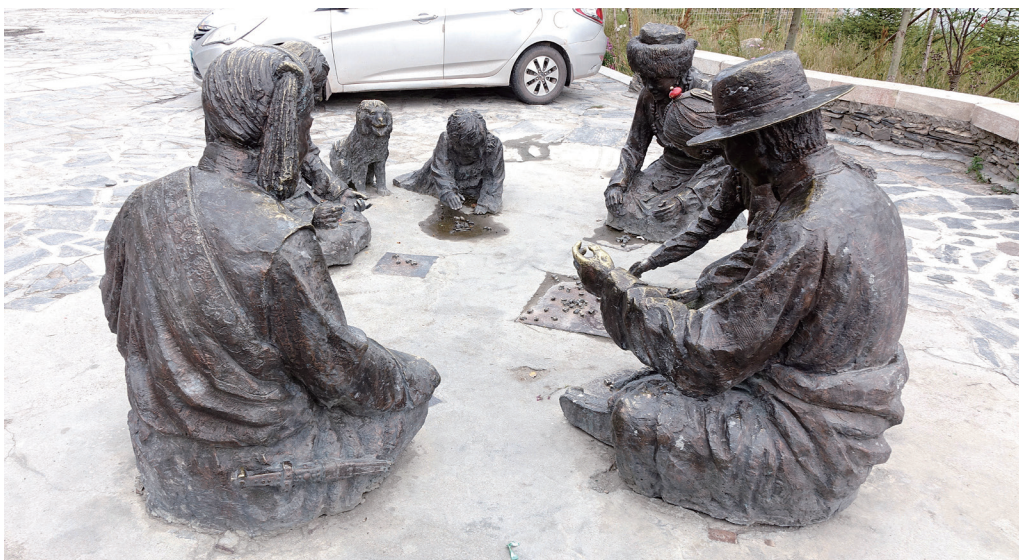
Fig. 3 Bronze sculptures of Tibetans playing knucklebones, central Skye rgu mdo.