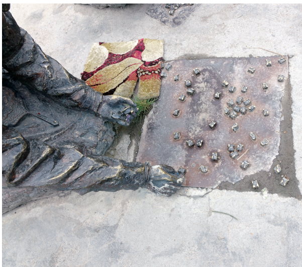
Fig. 4 A close-up of the same installation of sculptures showing a player poised to flick an ovicaprid astragal at others on the playing board.