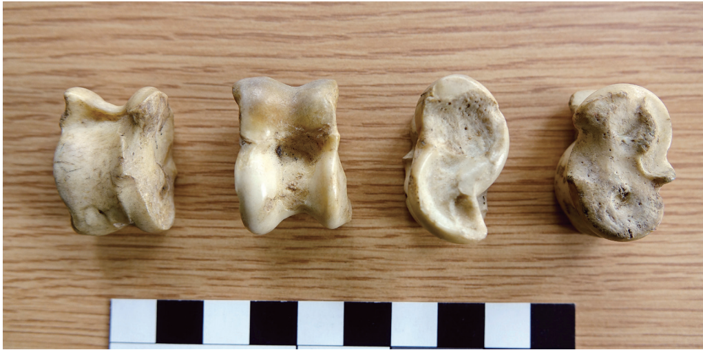
Fig. 1 The four sides of ovicaprid astragali Left: plantar; Middle left: dorsal; Middle right: lateral; Right: medial.

a broad array of functions, serving as ornaments, talismans and a medium of exchange for various Eurasian peoples, including Tibetans. Cowries were reproduced in Tibet and other locations on the continent using copper alloys and other substances. 3